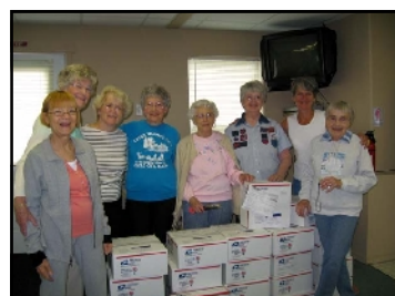
December 2008—new APO boxes