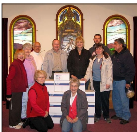
January 2009 Boxing Day