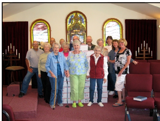
August 2010 Boxing Day