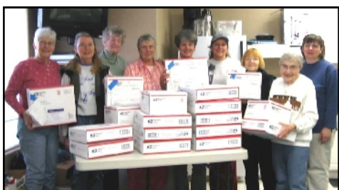
February 2008 First Boxing Day