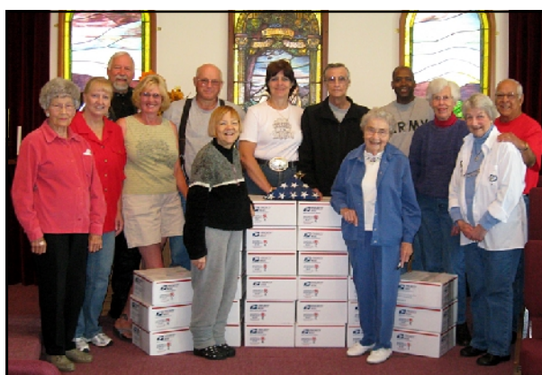
August 2009 Boxing Day