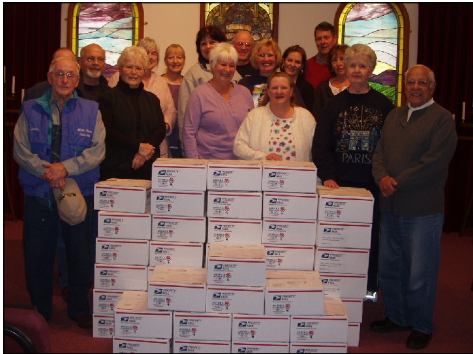
November 2011 Boxing Day — total shipped to date — 641