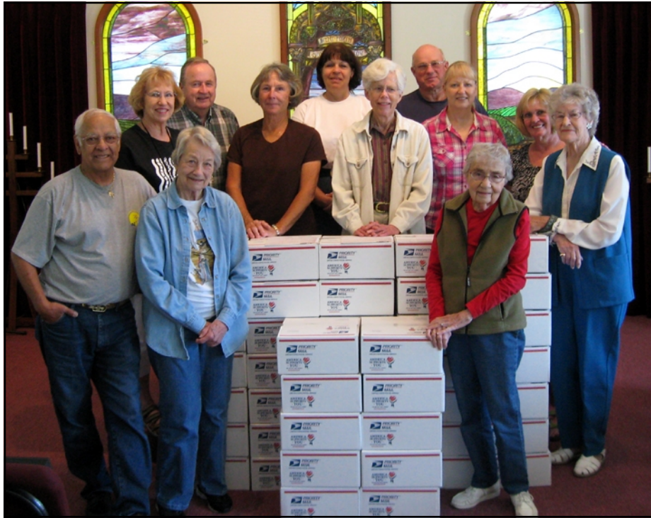
August 2011 Boxing Day